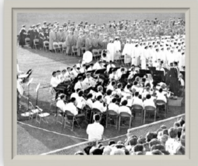
OUR CLASS OFFICERS